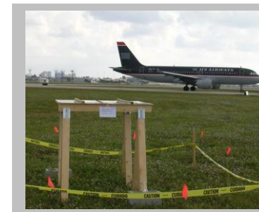
Photo taken during the West Palm Beach Airport Soot Study

Roadway air quality assessments for projects in AK, FL, GA, MD, MI, NC, TX and PR